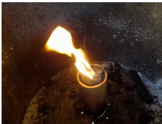
Figure 2 - Combustion of a load of sawdust impregnated with soybean oil.

The hybrid biofuel obtained by this process of filling bamboo with biomass impregnated with liquid biofuel will be used mainly in domestic wood stoves. For an efficient combustion and no interior smoke, an ECOFOGÃO (Miranda, 2003) will be designed, which will be modified to operate with bamboo stuffed with hybrid biofuel.