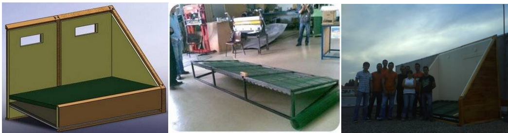
Figure 4. Solar kiln designed to dry 60 kg of local shrub species.

The thermal treatment was intended to make the resin over the printed circuit experience a temperature value evolution pattern that would cause a pre-heat, soak, reflow and cooling sequence, all of them within very tight time intervals. Different heating electrical resistances were tested inside a small lab furnace and the internal air temperature evolution data acquired to assess if the required conditions were being met.