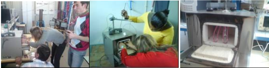
Figure 3. Wiring and preventing the thermocouple from direct exposure to radiation; IR emission.

In the end, the data was compared with the theoretical results, in order to assess the amount of time needed to bake and fry the potatoes. And though this was an atypical situation, the order of magnitude involved was quite satisfactory.