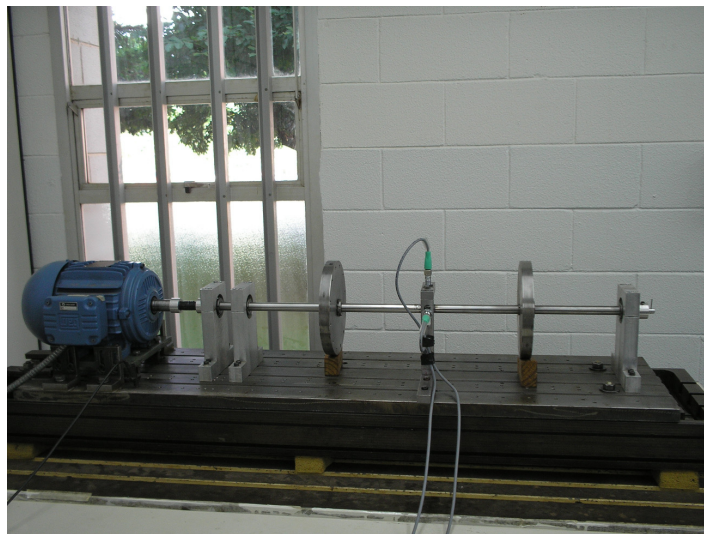
Figure 2. Rotor-bearing system

The main purpose of this work is to make a theoretical study of the proposed methodology in real systems. The system analyzed is showed by Fig. 2 and it is composed by one shaft, two discs and three rolling bearings.