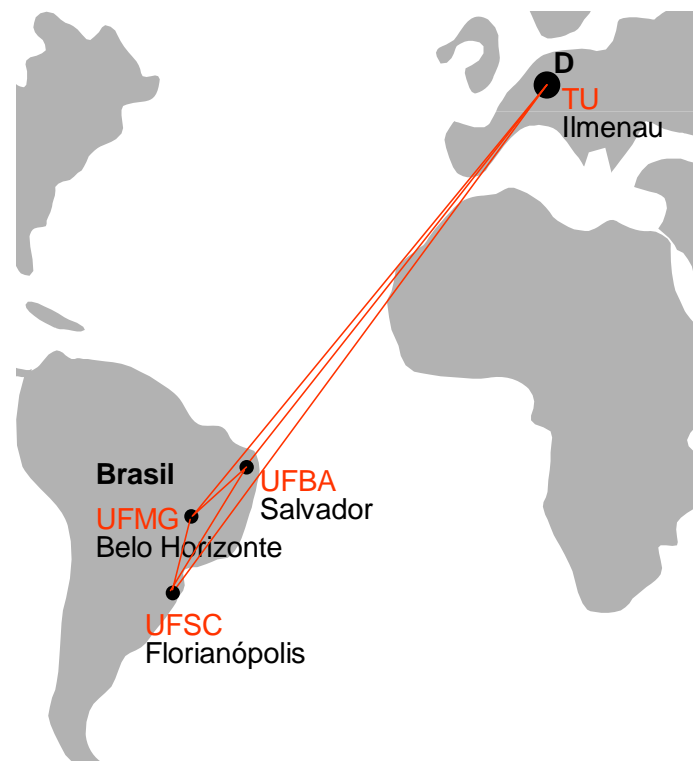
Figure 1 – International Education Network and its member universities