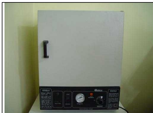
Figure 3 – The conventional oven for drying and sterilizing applications (EL-1.1 Plus), using in dry heat