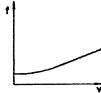
Figure 1. Friction x velocity curve for plastics sliding on steel.

A positive "f x v" curve also raises the damping capacity of the slideways in the direction of motion which improves the dynamic rigidity of the machine. The types of plastics most used for avoiding stick-slip are the following: PTFE-based plastics, epoxy resin with anti-stick-slip fillers, acetal resin with MoS 2 or PTFE.