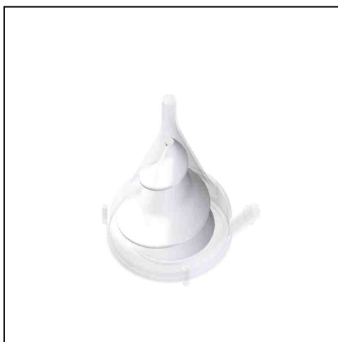
Figure 1: The Spiral Pump assembly is shown.