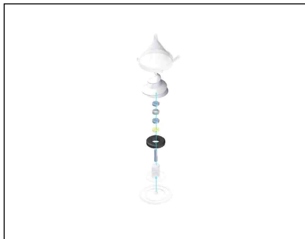
Figure 2 : Spiral Pump assembly schematic