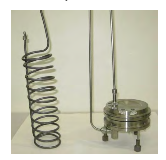
Figure 1 – Pre-saturator (L) and saturator (R)

Based on the international and national experience of the team of the Hygrometry Laboratory, which are in constant contact with many National Metrology Institutes and literature (de Groot, 1998) it was constructed a first prototype of a humidity generator, so as to evaluate the performance of the equipment and acquire the necessary experience in this field. The saturator design is based on three stages. The first one, called pre-saturator, is formed by copper tubing in the form of a coil and is located inside the thermostatic bath, and it is shown of left side of Fig. 1. The idea is to approach the gas temperature to bath temperature before entering the saturator itself.