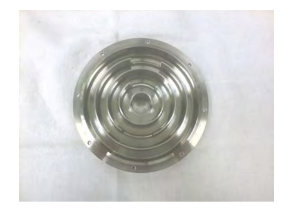
Figure 2 – View of the internal part of the humidity generator

Figure 2 shows the path the gas is forced through the humidity generator. This equipment has two stages, similar to the one shown.