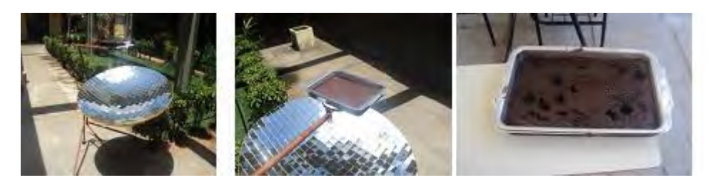
Figure 11. Process of baking a cake in the solar cooker proposed.

The sixth test food was a chocolate cake industrialized, wherein the prepared dough was placed in a rectangular shape, with a mass of about 700 grams. The test was performed with excellent solarimétricas and began at 11:08. Room temperature was approximately 31.5 \degree C. The baking time was 50 minutes. That time is competitive even with the gas stove with baking time for this food between 45-50 minutes. Figure 11 shows the baked cake in the solar cooker tested.