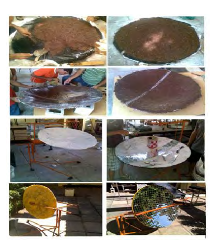
Figure 2. Some steps of the manufacturing and assembly of the solar cooker studied.

Figure 2 shows the constructional details of the structure conceived and built.