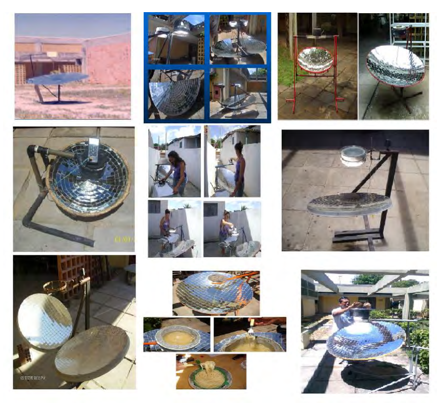
Figure 1. Solar cookers manufactured and tested in LMHES / UFRN.

Figure 1 shows the various types of solar furnaces have already been manufactured and tested in LMHES / UFRN.