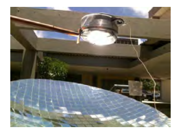
Figure 5. Solar cooker proposed test for boiling water.

Considering that the time for boiling 1.5 liters of water in a conventional oven is 12 minutes. Even having a boiling time much greater than that obtained with the gas stove, the wide feasibility study thermal solar cooker was demonstrated. It is noteworthy that uses a free energy, inexhaustible, widely distributed and environmentally friendly. Compared to other stoves already tested, and shown in the literature to solar cooking food, the stove has studied very competitive. For other solar cookers, literature always points times around 20-30 minutes, or demonstrates the competitiveness of the proposed stove. Figure 5 shows the solar cooker manufactured in the boiling water test.