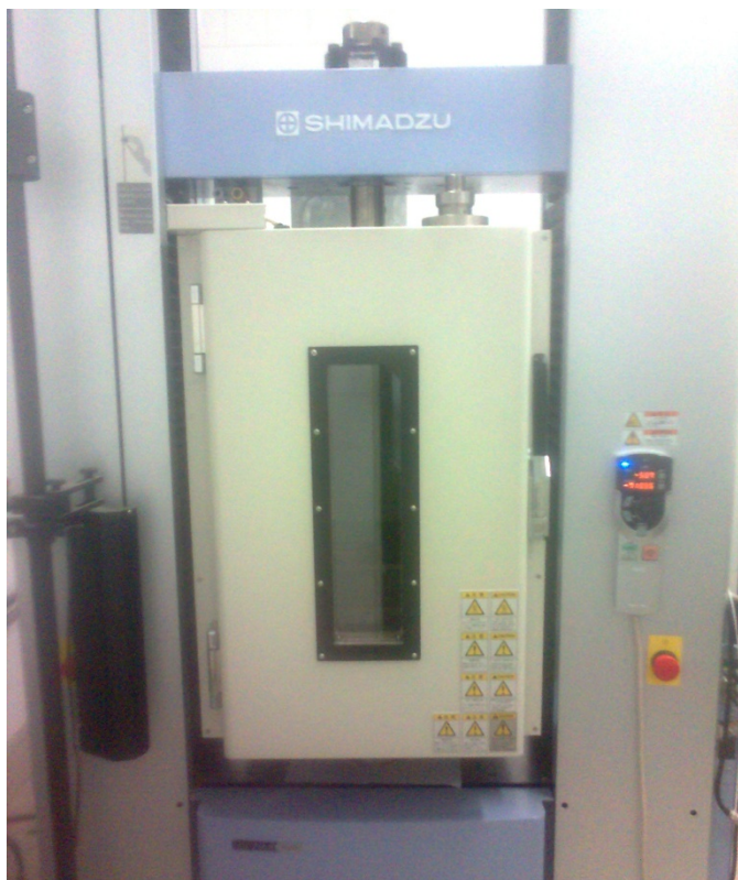
Figure 1 – Machine used in the tensile tests

The specimens were cut 250 mm by 25 mm, leaving a gauge section of 200 mm. The tensile tests were performed on a Shimadzu AG-X tensile testing machine at 3 different strain rates, 1.6 \cdot 10^{-5} , 1.6 \cdot 10^{-4} , 1.6 \cdot 10^{-3} \text{ s}^{-1} . Attached to the testing machine a thermostatic chamber was used to set the temperature test environment, as shown in Figure 1. The test temperature used were, 23°C, 40°C, 60°C, 80°C and 100°C. For each temperature the GFRP specimens were tested at all strain rates.