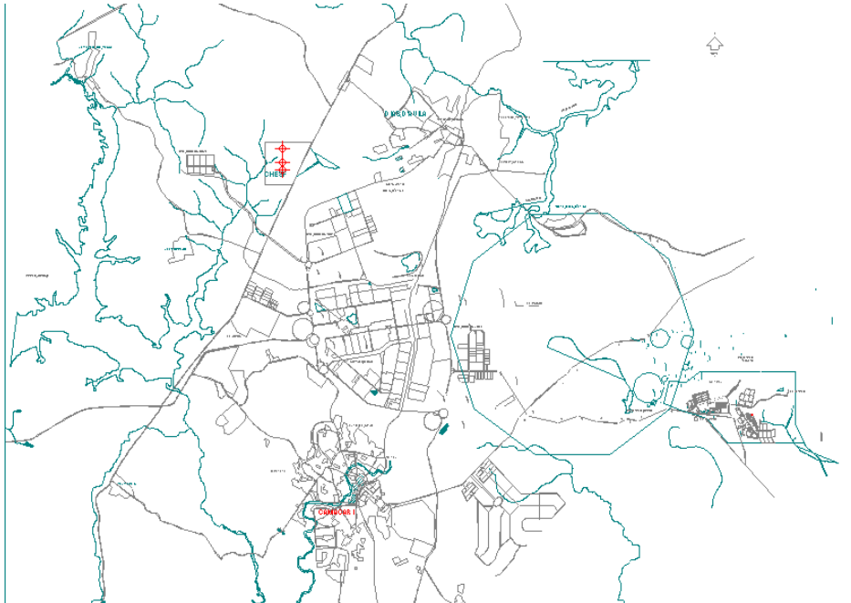
Figure 1. Map of CHESF Official Influence Area.

A grid was elaborated with spacing of 1575 by 1148 meters, totaling 1152 receptors and consequently 1152 evaluation areas, containing the coordinates x, y. In this case, the coordinate z is zero, because all of the estimates of the pollutant concentrations were calculated at the ground level.