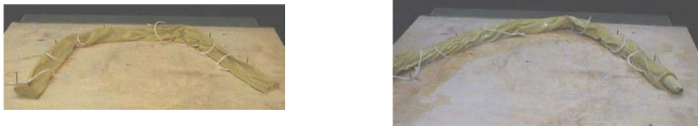
Figure 4. Simulated bowel on the left, simulated bowel with balloon deployed in it on the right..

The second experiment involves deployment along a tube made of latex rubber and of the same dimensions as the balloon. This more accurately simulates human bowel. Fig. (4) shows the parts used in this experiment. In all experiments of this type the balloon has been deployable along the whole length of the simulated bowel in a few seconds using human lung-power to drive the system.