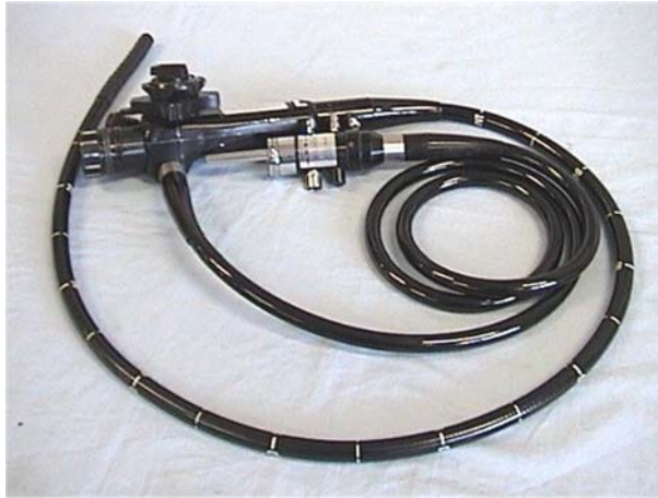
Figure 1: A typical colonoscope.

has been reported (Mosse, 1999). Here four different ways of assisting a colonoscope to traverse the bowel are described. These are: