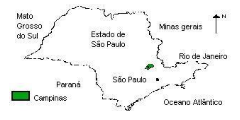
Fig. 1. Geographic localization of Campinas, Brazil.

The state of São Paulo, localized in the south east of Brazil, is formed by 645 municipalities, of which Campinas is the third in population, about 1039,297 inhabitant in 2009, about 99 km from the capital of the state of São Paulo and with territorial area of about 796 km<sup>2</sup>, as can be seen in Fig. 1.